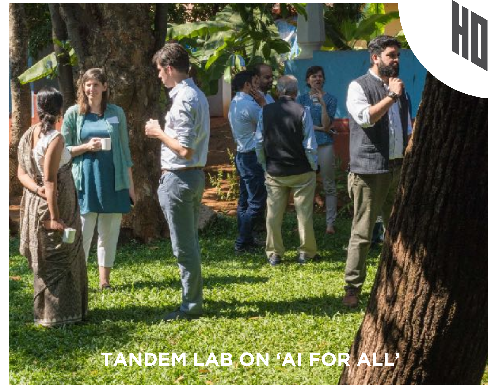
TANDEM LAB ON 'AI FOR ALL'