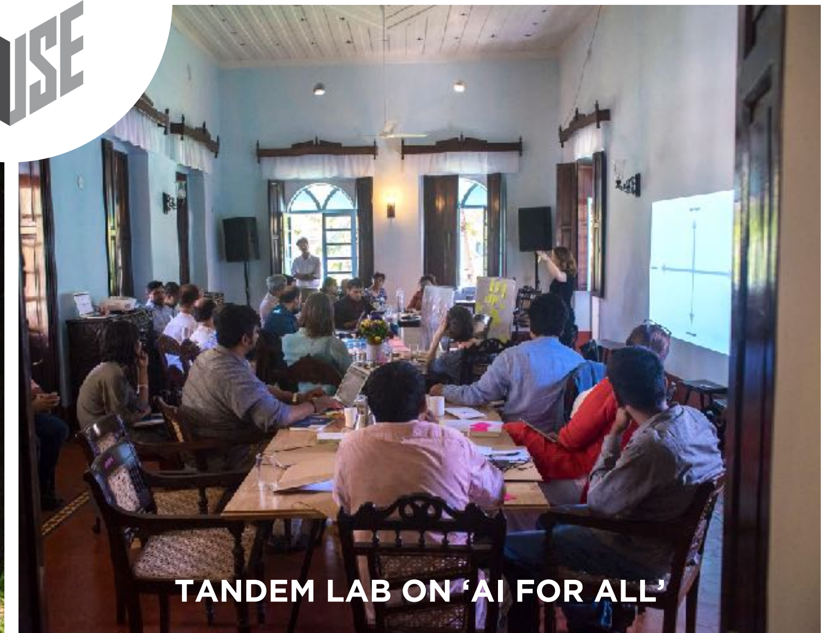
TANDEM LAB ON 'AI FOR ALL'