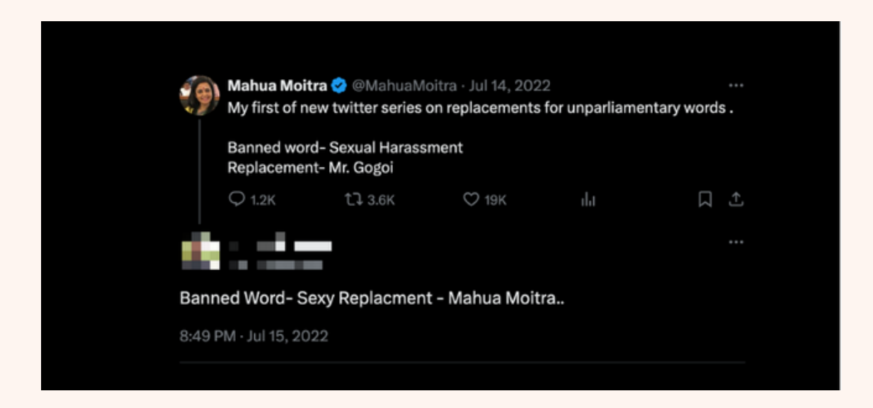
Image 3: Mahua Moitra is frequently the target of comments sexualising her or referring to her physical attributes (from X)

Mahua Moitra, a member of parliament from the All India Trinamool Congress, is also heavily scrutinised for her fashion choices and her looks, and is the target of comments that often veer towards sexualisation<sup>65</sup> (see Image 3).