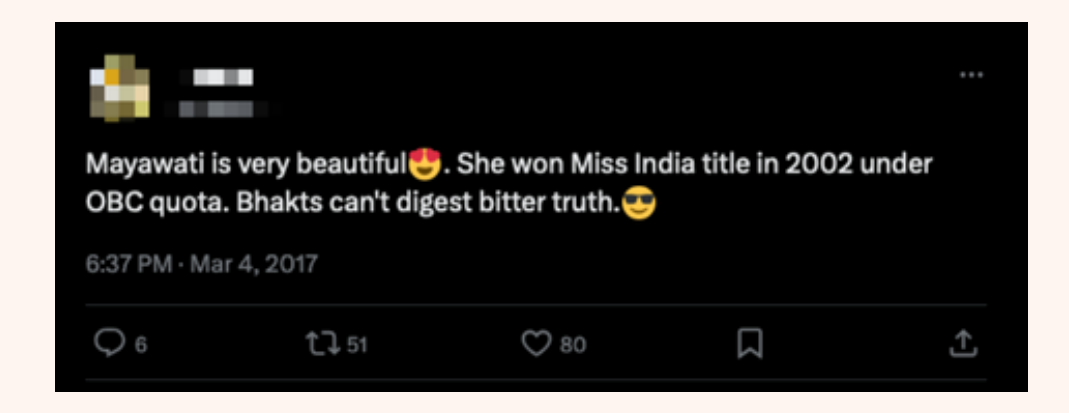
Image 1: A post mocking Mayawati's physical appearance and caste identity (from X)

Mayawati is a Dalit leader who broke caste and gender barriers to rise through the ranks of the Bahujan Samaj Party and become chief minister of Uttar Pradesh, India's most populous state, four times.<sup>61</sup> When she joined Twitter in 2019, she was met with a torrent of casteist and misogynist abuse. These spanned remarks on her skin colour, her perceived lack of education (despite her law degree), and jokes about reservation<sup>62</sup> (see Image 1).