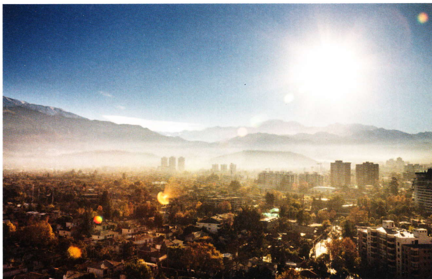
Chilecon Valley: view of Santiago

"These tweaks were tailor-made for MNCs," he noted. "Such policy prescription isn't easily found in other countries."