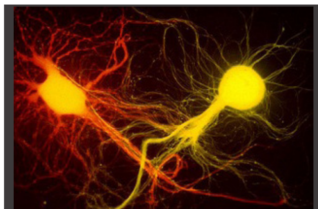
this is your brain on connections

There will be 20 new docks in which to anchor your own boat of experiences, and start the haul of goodies. You see, in the vast ocean through which we sail our own personal odysseys, the important moments are those of cargo exchanges, of serendipitous meeting in the middle of the ocean, or those orchestrated by the topography of life. Digital Natives is a bay - A bay where you all have anchored at least a part of your boat for the last couple of months. In two weeks, 20 new boats shall arrive from the Caribbean Sea.