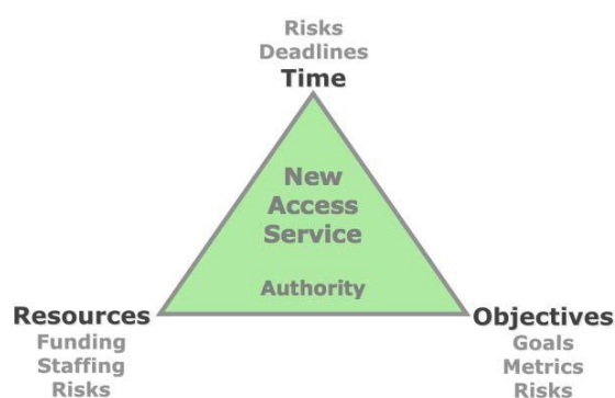
Figure 3 - Trade-offs when introducing a new access service

The UK Communications Act of 2003 is generally regarded as a good example of a legal framework for television access services. It lays down a number of supply-side requirements for captioning, audio description, and signing on broadcast television and a roadmap for their implementation. The US 21st Century Communications and Video Accessibility Act signed into law on 8 October 2010 also warrants attention. Organizations such as Tiresias.org have produced easy-to-use checklists based on accessibility research to optimize the design process. One such checklist can be found at http://www.tiresias.org/research/guidelines/checklists/television_checklist.htm