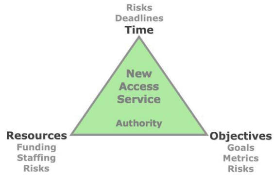
Figure 3 - Trade-offs when introducing a new access service

The UK Communications Act of 2003 is generally regarded as a good example of a legal framework for television access services. It lays down a number of supply-side requirements for captioning, audio description, and signing on broadcast television and a roadmap for their implementation. The US 21st Century Communications and Video Accessibility Act signed into law on 8 October 2010 also warrants attention. Organizations such as Tiresias.org have produced easy-to-use checklists based on accessibility research to optimize the design process. One such checklist can be found at http://www.tiresias.org/research/guidelines/checklists/television_checklist.htm